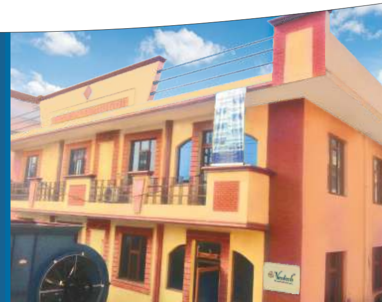
OUR MANUFACTURING FACILITY